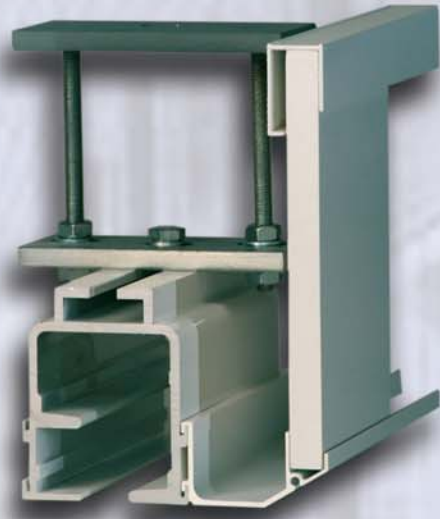
2 point-aluminium-track with 2 point-carrier